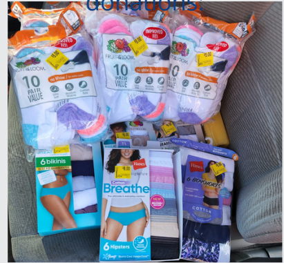
Examples of excellent clothing & linen donations: